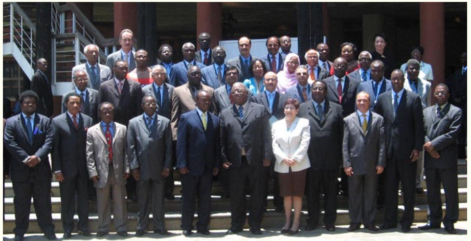
Zambian Vice-President Rupiah Banda pose for a photo with COMESA Council of Ministers and Head of Delegations

He said the destructive effect on the economies has to a certain extent been mitigated by the high commodity prices thanks to the demand by China and India. It is however uncertain that these high commodity prices will be sustained in view of planned increases in production that will be coming on stream a couple of years from now. Regarding energy security, the President was happy to note that Ministers of Infrastructure, energy, transport and communications at